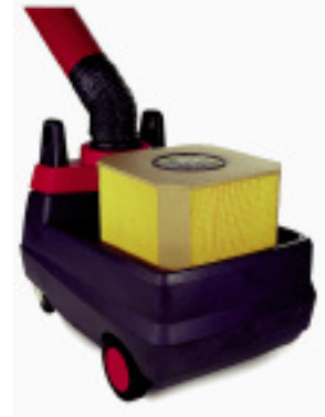
LongLife® Filter inside of unit