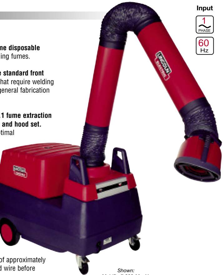
Shown: Mobiflex™ 200-M with optional Extraction Arm